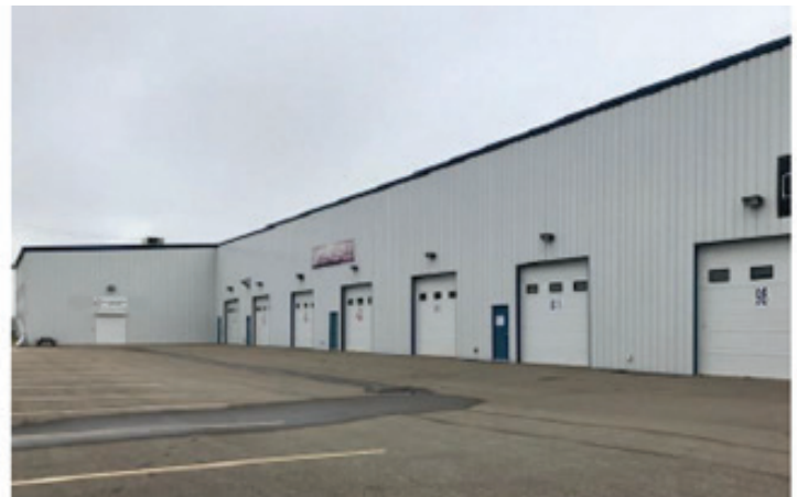
New Building - 16,000 Sq. Ft.

On April 13, 2022 we were happy to announce that our organization was a recipient of the province of Alberta Community Facility Enhancement Program (CFEP) which awarded our organization a grant of $690,550, with funds to go towards the purchase of the building! This exciting announcement included the details that we have raised 50% of the cost of the building project. Help us meet our goal of raising $1,532,000 to complete the new building project!