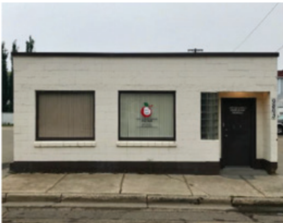
Old Building - 1,650 Sq. Ft.

We, unfortunately, could not grow our services to effectively serve the ever-growing need for food, goods, and support throughout the community.